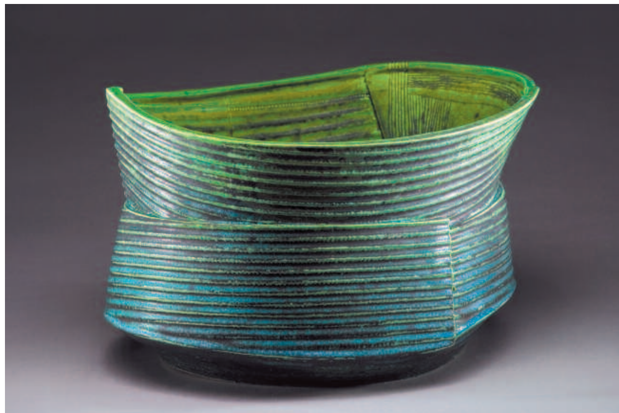
'Towong Tank', 2007, handbuilt stoneware, 26 x 45 x 36 cm