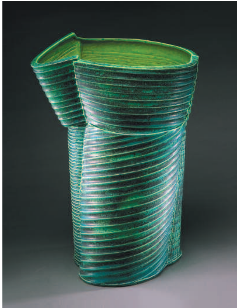
'Brindabella Lines', 2007, handbuilt stoneware, 58 x 28 x 26 cm