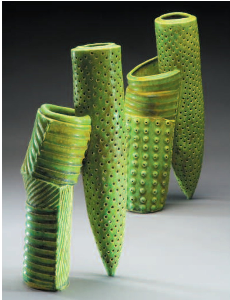
'The Restraint of Function', 2005, handbuilt stoneware, tallest 38 x 26 x 22 cm