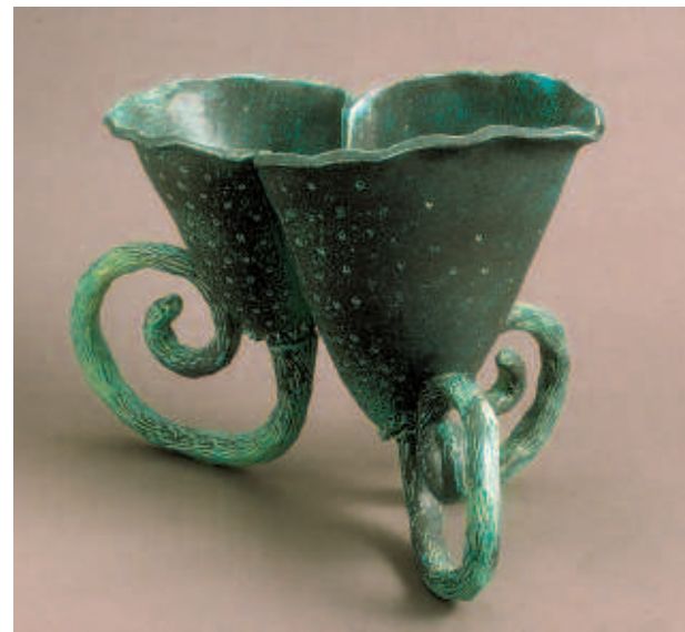
'Double Talk', 1999, handbuilt stoneware, 00 x 00 x 00 cm