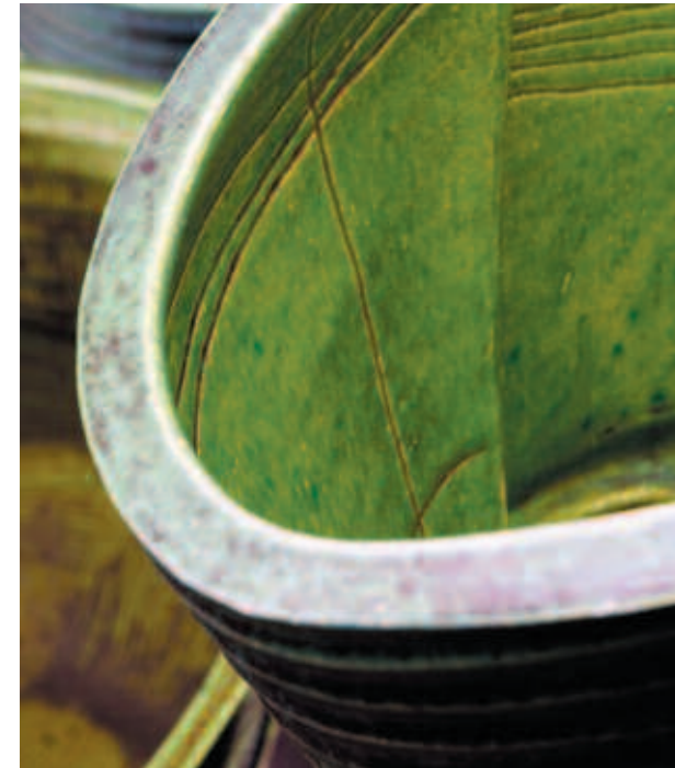
'Jagungal Series', 2007, rim closeup

ning of the surface markings which later take on a new and unique form.