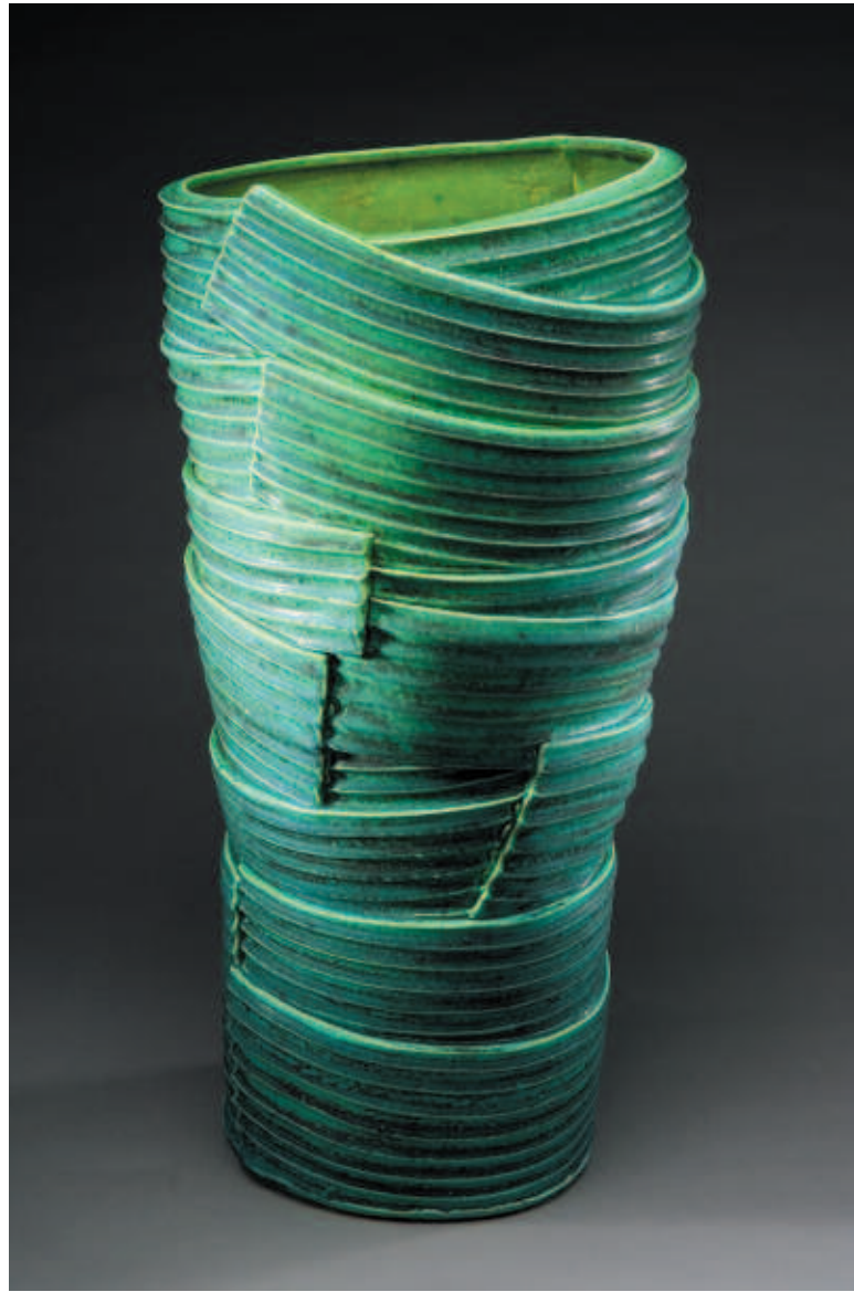
'Coppabella Lines', 2007, handbuilt stoneware, 69 x 38 x 32 cm. Detail below