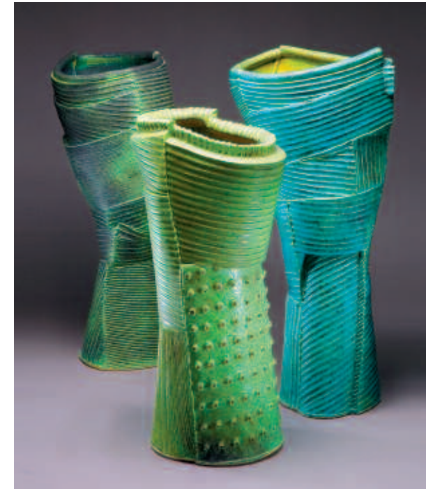
'Tumbarumba Series', 2005, average height 90 cm