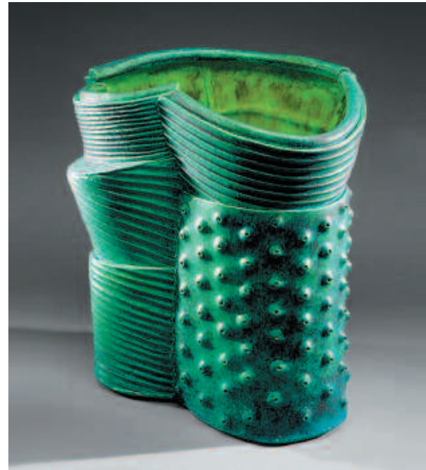
'Corrugated Bucket', 2005, handbuilt stoneware, 56 x 51 x 43 cm. Collection: Gold Coast Regional Art Gallery, Queensland