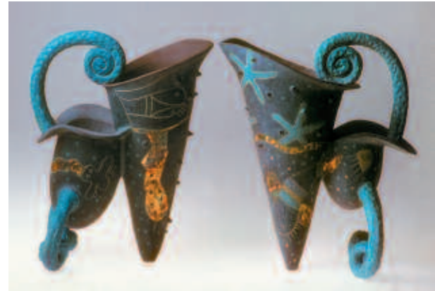
'Starfish and Double Trouble', 1993, stoneware, 00 x 00 x 00 cm