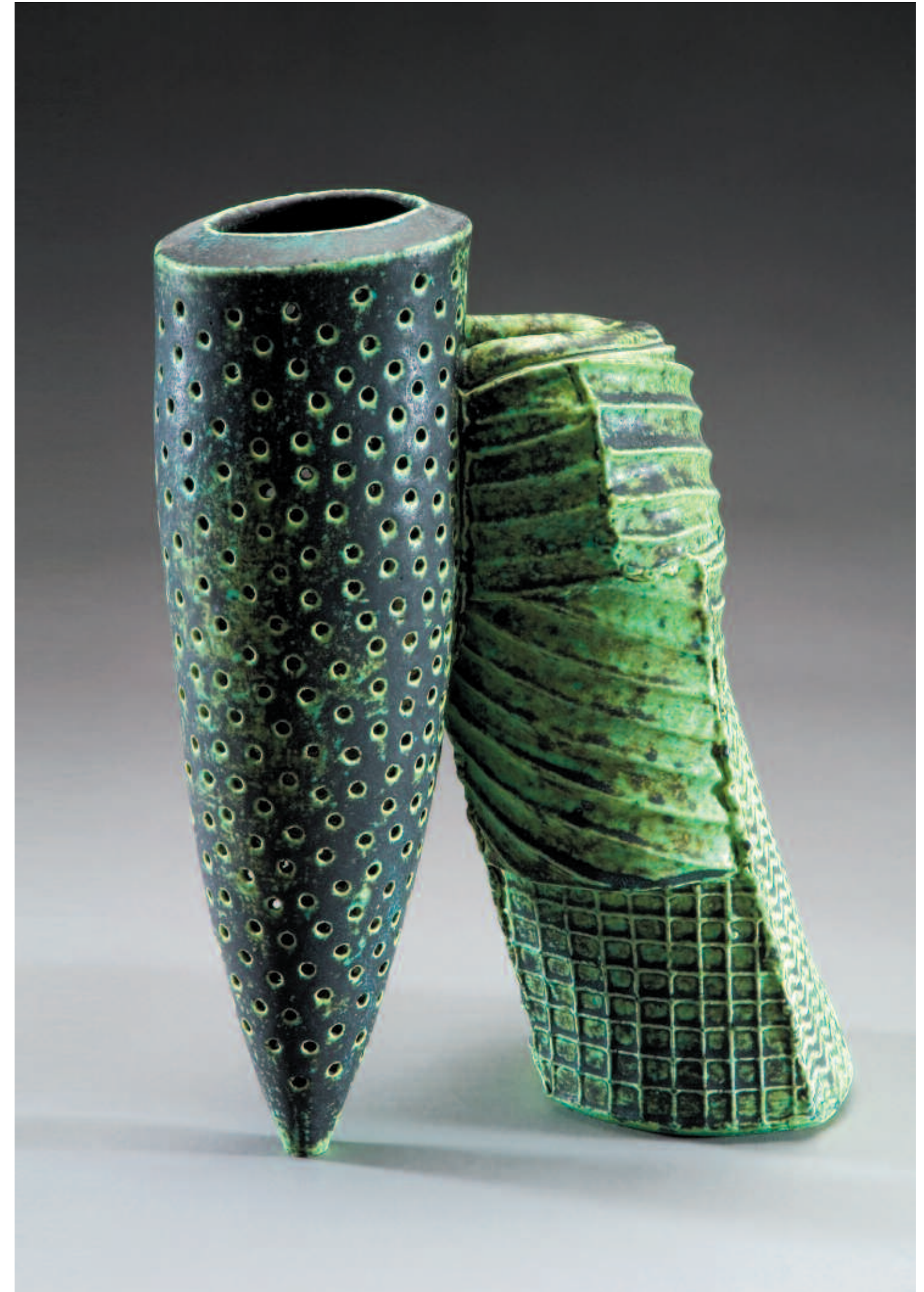
'Conical Construction', 2005, handbuilt stoneware, 32 x 25 cm

While the main forms might indeed retain a functional 'Corrugated Skuttle', 2004, handbuilt stoneware, 58 x 45 x 29 cm. Collection: Westervald Keramik Museum, Germany