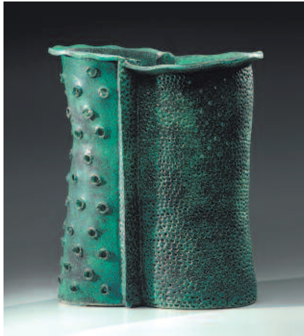
'Doubleshot 2', 2002, handbuilt stoneware, 69 x 56 x 34 cm. Collection: National Gallery of Australia, Canberra